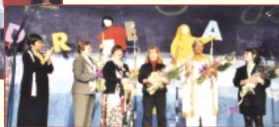
CHSA 2002 Awardees