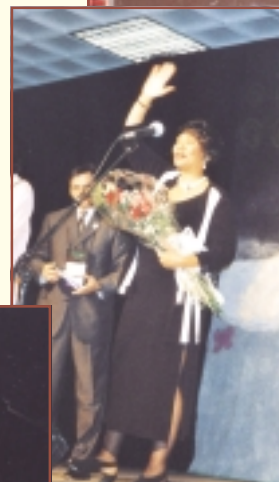
Yolanda King receives a standing ovation