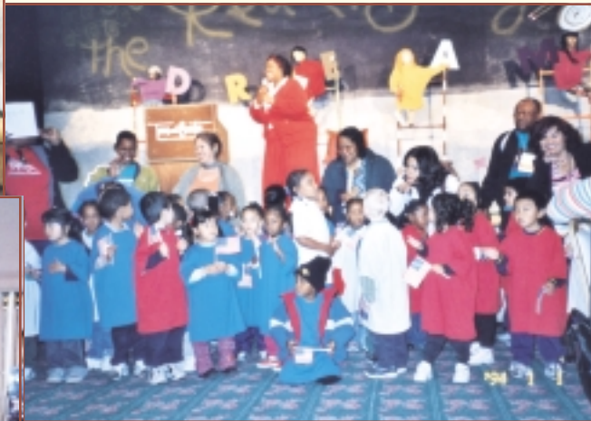
Children for Neighborhood House Association perform

Over 1520 individuals from over 94 different organizations attended the four days of speakers, exhibitors, health resources, VIPs, workshops and networking sessions.