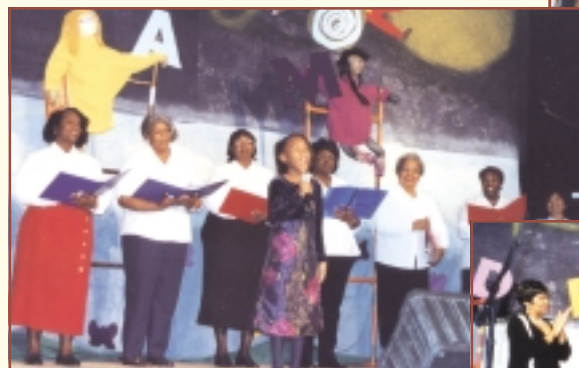
Head Start Choral