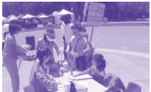
Pictured above: Sacramento's SETA/Walnut Grove 2005 Graduation. Pictured below: San Francisco's Head Start Children at 40th Celebration June 18, 2005.