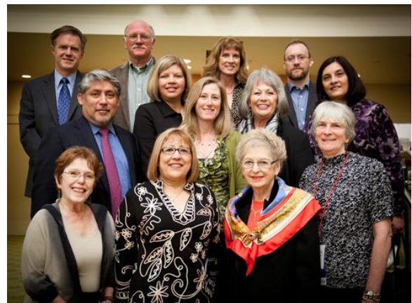
CHSA Board of Directors