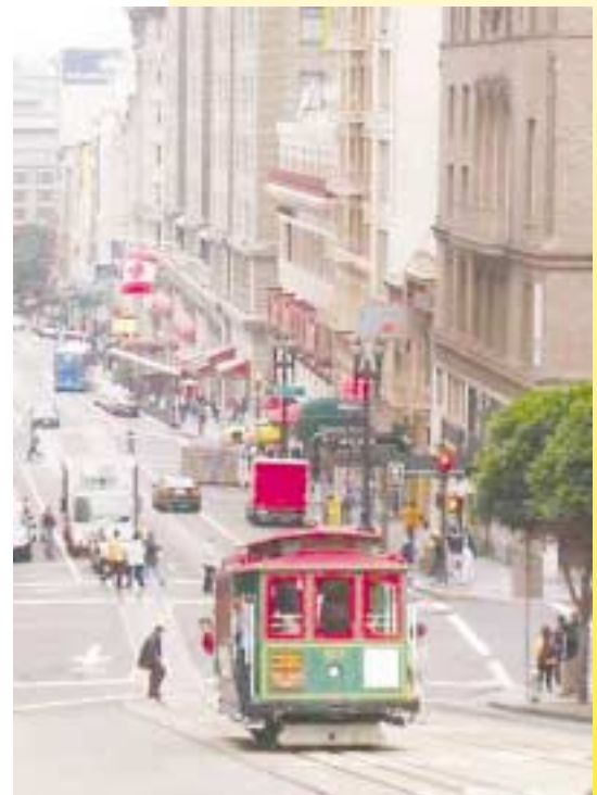
San Francisco cable car

SAVE THE DATE! JANUARY 21-24, 2004 Check the CHSA website for conference updates