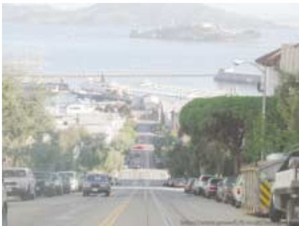
View of San Francisco Bay